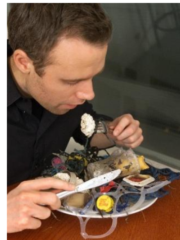
FIGURE 3. MICRO-PLASTIC PARTICLES CAN MOVE UP THE FOOD CHAIN, CARRYING WITH THEM TOXIC POLLUTANTS.

and ocean-based. Smaller in size, the particles are more likely to be ingested by wildlife such as filter feeders and deposit (bottom) feeders. Micro-plastics may then move up the food chain when these creatures are eaten by predators such as birds, crabs, starfish and humans. These plastic fragments have also been shown to concentrate persistent organic pollutants (POPs) such as DDT, PCBs and dioxins, and their movement up the food chain may increase the exposure of wildlife and humans to these dangerous toxins. Micro-plastic particles may pose a similar threat if ingested by organisms in our soils and in freshwater ecosystems. Prudence and the Precautionary Principle would dictate that any source of plastic fragments, including plastic-coated paper products from composting operations, should be eliminated in order to decrease the impact of the growing problem of plastic pollution in all environments.