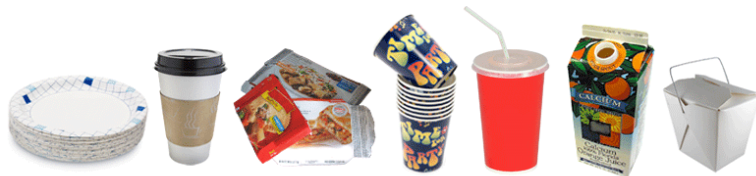
FIGURE 1. COMMON PLASTIC-COATED PAPER PRODUCTS.

The growing epidemic of plastic pollution in the environment has led to concerns about what happens to the plastic coatings on these products during the composting process, since petroleum-based plastic particles break down into smaller fragments but do not biodegrade. New research from Eco-Cycle and Woods End Laboratories demonstrates that micro-plastics are shed from all plastic-coated paper products during composting. These micro-plastics may pose a significant risk to our soils, freshwater and marine environments, wildlife, and ultimately, human populations. This potential threat justifies a ban on non-biodegradable plastic-coated paper products in compost.